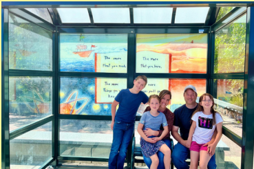
New bus shelter artwork at the Library bus stop