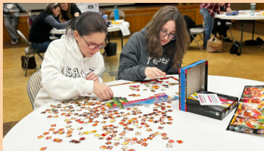
Jigsaw Puzzle Grand Championship Competition at Hal Holmes