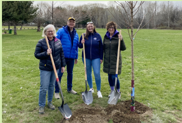
2023 Tree City Celebration