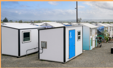
Sample Pallet Shelter

In response to the increasing visibility of people experiencing homelessness and behavioral health challenges, and in light of 9th Circuit Court of Appeals decision in Martin v. City of Boise, Ellensburg and Kittitas County created an Ad Hoc Committee on Homelessness and have worked collaboratively with other nonprofit partners (since 2022) to 1) identify service gaps; 2) update policies for public camping; and 3) start joint planning for a year-round sleep center (location to be determined). Together, the City and County are working to locate and fund a countywide overnight sleep center facility. Learn more at www.ellensburgwa.gov/sleepcenter