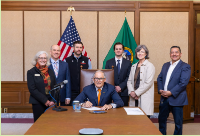
Gov. Jay Inslee Signs SB6047 in March 2024