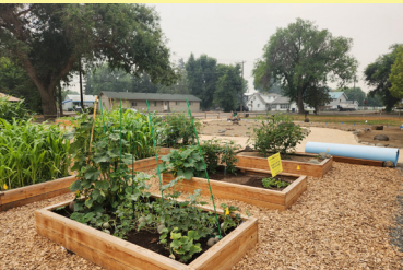
Wippel Park community garden and pollinator garden

Learn more at www.ellensburgwa.gov/sustainability