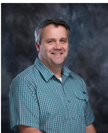
Rich Elliott Mayor

Learn more about the City Council at www.ellensburgwa.gov/citycouncil