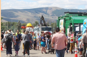
Touch-A-Truck is scheduled from 11 a.m.-2:30 p.m. June 18, 2024 at Rotary Park