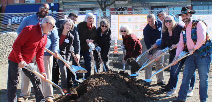
Groundbreaking Ceremony on March 30, 2024